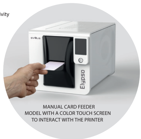
MANUAL CARD FEEDER MODEL WITH A COLOR TOUCH SCREEN TO INTERACT WITH THE PRINTER